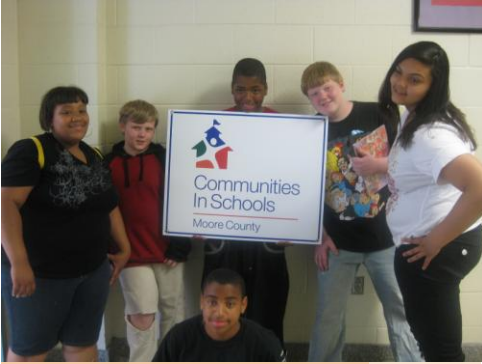
7 th graders pose with the new CIS Logo as part of the CIS National One Voice campaign.

Communities In Schools has unveiled a new logo that is part of an effort to obtain national recognition. The comprehensive rebranding effort, known as the One Voice campaign, was designed to focus and contemporize Communities In Schools' core messages and visual identity. The campaign unifies the words and images being used to represent Communities In Schools around the country, and raises the organization's visibility, both nationally and in the local